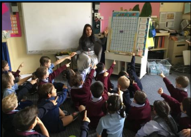
There is no doubt the students in FE were very excited to be back in the classroom. On my visit, they were VERY enthusiastic about working out the missing number!