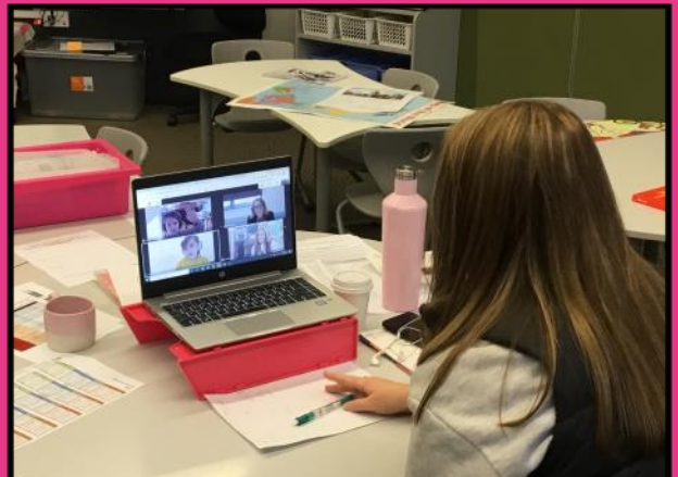
It is so exciting to have the F-2 students back on-site, but the home learning continues for our Year 3 to Year 6 students. Keep up the great work. See you soon!