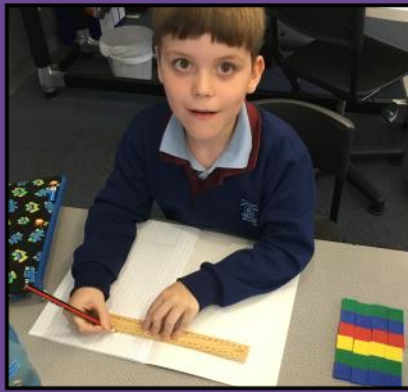
The Year 2C students were so engaged in their lesson on perimeter. They were using hands on materials to support their learning.