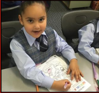
We hoped you enjoyed the SMPS version of the National Simultaneous Storytime Book!! The students enjoyed completing some additional activities about the Chicken Divas.