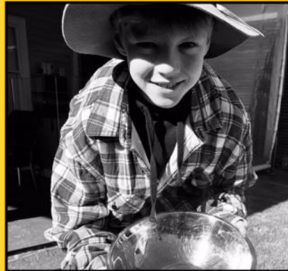
Did we manage to sneak an excursion in to Sovereign Hill? No.....it is just our Year 5 students showing their creative skills by still get into the spirit. Well done!