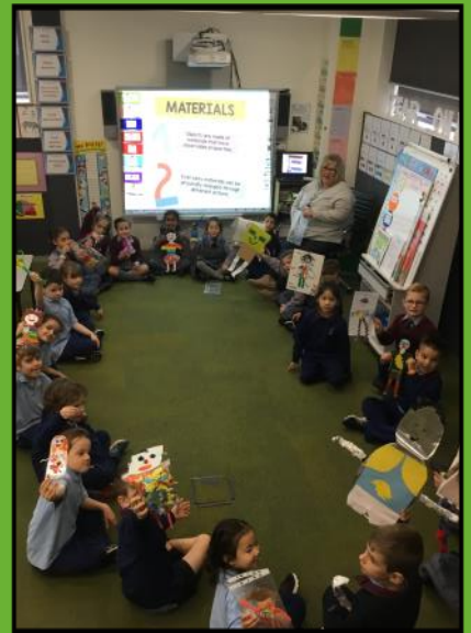
The Year 1 students made 'characters' by bending, twisting, scrunching and stretching different materials when they were remote learning. They were very excited to share their characters with their friends.